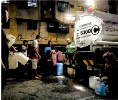
TOUGHER ENFORCEMENT NEEDED: Taman Datuk Harun residents line up to get water in Petaling Jaya. Over a million Klang Valley residents were affected by the most recent pollution and many are clamouring for stiffer penalties and other solutions for the continued supply outages due to pollution and others.