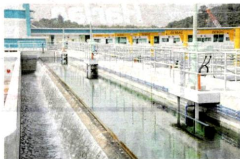
Pembinaan Loji Rawatan Air Langat 2 bernilai RM4 bilion dijangka berupaya membekalkan air bersih dan terawat kepada kira-kira 1.87 juta pengguna.

akan dialami penduduk Lembah Klang sekiranya LRA Langat 2 dapat beroperasi sepenuhnya ketika ini kerana operasi loji sokongan itu pastinya mengurangkan impak gangguan kepada penduduk daripada 60 peratus kepada 30 peratus.