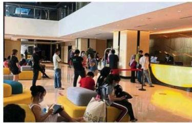
A hotel in Klang was fully booked during the weekend as locals checked in after hearing that the water problem would last four days.

"So my wife and I decided to get out of town for the weekend and