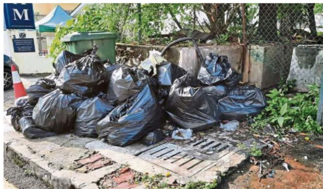
Bags of rubbish left uncollected along Lorong Utara B near the Astaka Sports Complex in Petaling Jaya.

Angry visitors call on MBPJ to clear rubbish around Astaka Sports Complex >4