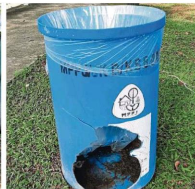
A rubbish bin with a gaping hole and still has the council's logo from its municipality days.