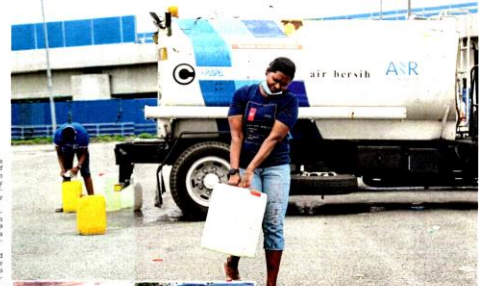
A woman carrying to carry a water container in Tameng Daging, Ampang, yesterday. (Inset) The machinery maintenance factory in Rawang.