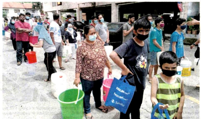
Pencemaran sungai ditafsir sebagai sabotaj bekalan air negara dan menjejaskan keperluan asas rakyat.

"Selain itu, lesen perniagaan syarikat berkaitan (harus) dibatalkan dan pemilik premis atau pemilik syarikat perniagaan termasuk lembaga pengarah dan pengurusan syarikat disenarai hitam daripada menjalankan sebarang aktiviti perniagaan bagi tempoh sekurang-kurangnya 10 tahun," kata beliau dalam satu kenyataan di sini semalam.