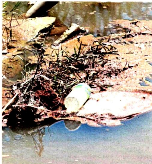
Rubbish thrown into Sungai Gong in Rawang, Selangor. Effluents, allegedly from a machinery maintenance factory, have caused several water treatment plants along the river to shut down.