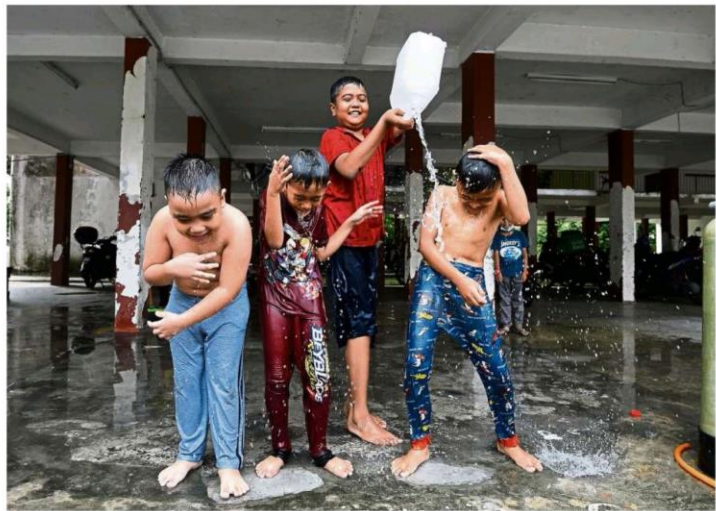
Sheer joy: Children enjoying a shower after the water supply returned at their apartment in Kota Damansara, Selangor. — AZHAR MAHFOF/The Star

"Therefore, (the amendment) will expand the power of the local councils in imposing stern action against the offenders," she told a press conference yesterday. — Bernama